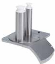
Long vegetable attachment