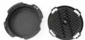
Grid cleaner kit