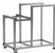
Stand - trolley